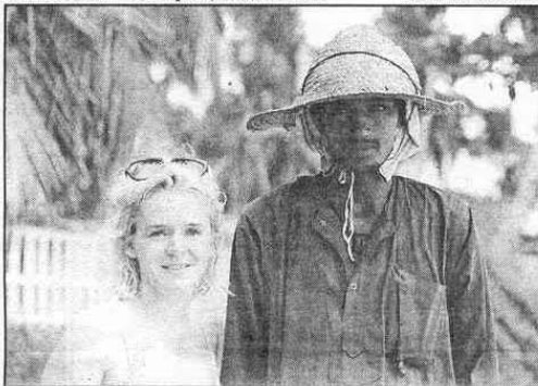
Charmante rencontre au Gabon.