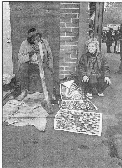
Avec un aborigène et son didjeridu dans les rues de Sydney.

te que je veux voir des icebergs, comment ils se forment. On dirait que ça me parle d'une façon particulière...»