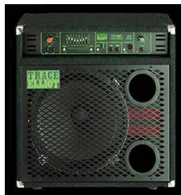
Trace Elliot bass