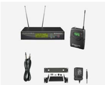
wireless instrument system